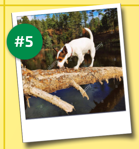
Balance Beam Walk something narrow