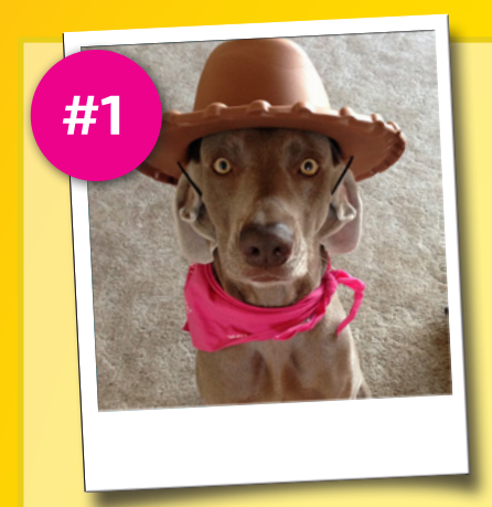
Hats Off! Take a picture wearing a hat

Take a photo or video of at least 15 of the 20 challenges. Show to your instructor or to a Facebook Spark Team. Once approved, submit for your certificate!