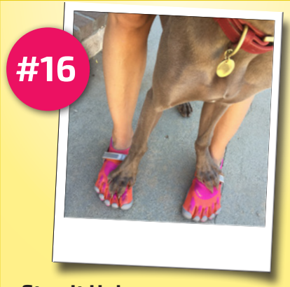
Step It Up! Front paws on something