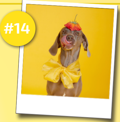
Smell the Flowers Take a picture with a flower