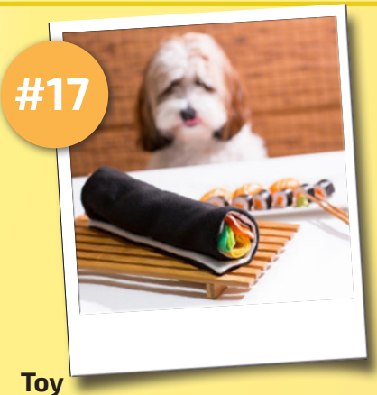
Show us your favorite toy