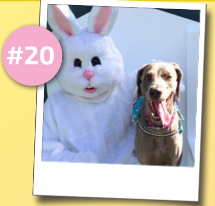
Meet a New Friend Animal friend or person friend