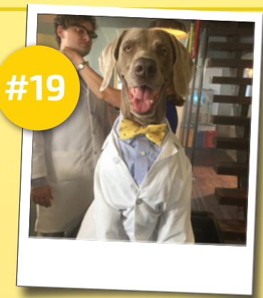
On the Job Your dog doing your job