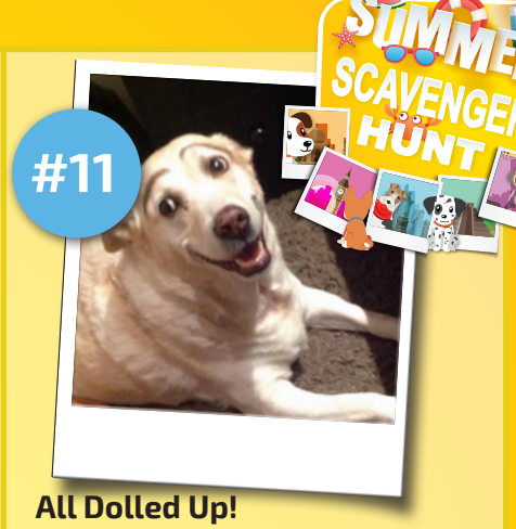
With eyebrows or bow/bow-tie