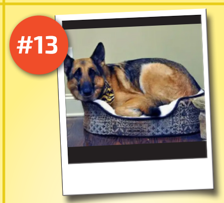
In a Tight Spot Your dog in something small