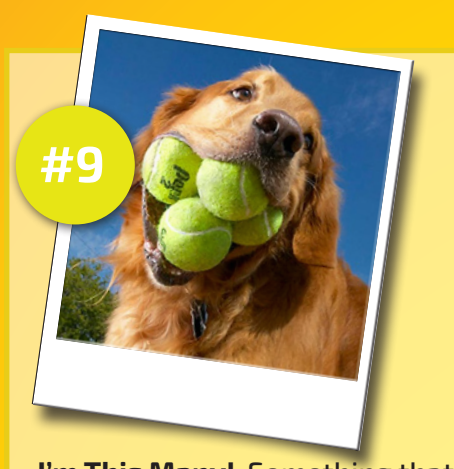
I'm This Many! Something that represents their age