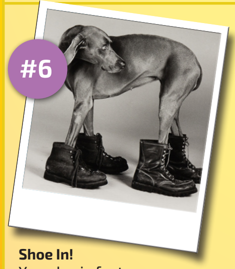
Your dog in footwear