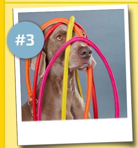
Leash Up! Show us your favorite collar or leash