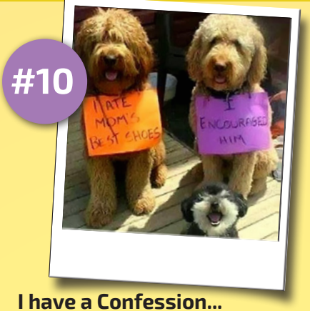
I have a Confession... A sign with your dog's escapades