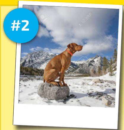
Rock On! Do a trick with or on a rock