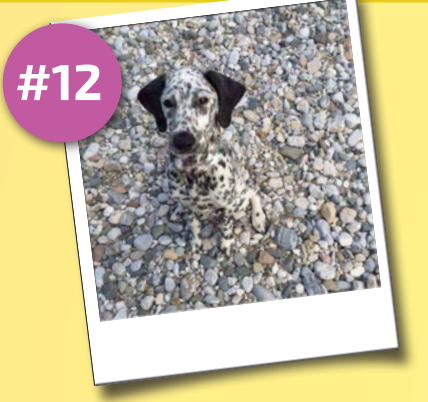
Camouflage Blending in with their surroundings