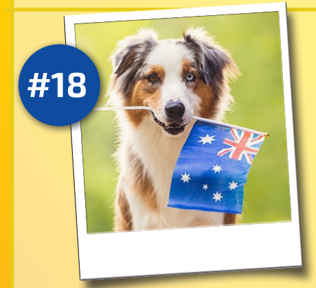
Well Bred Represent your breed