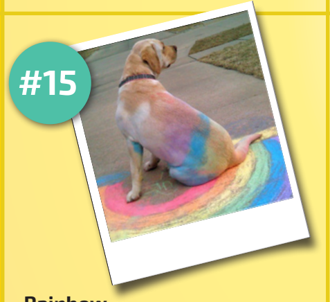
Rainbow Take a picture with a rainbow