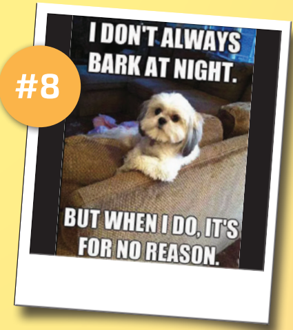
Meme Me! Add a funny saying to your dog's pic