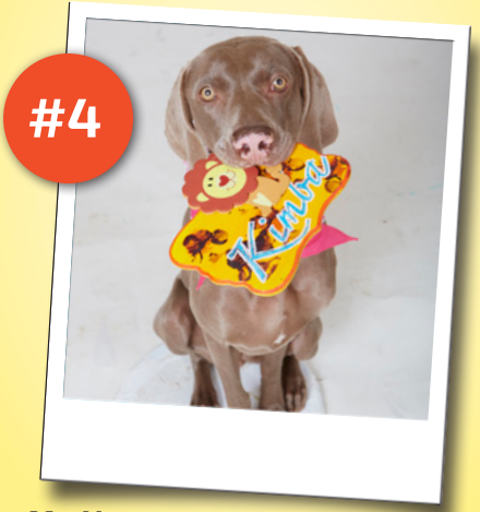
My Name Something with your dog's name